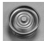
Properly installed Auer exhaust valve diaphragm (outer cover of exhaust valve not shown)

Conduct inflation tests according to ASTM F1052, “Standard Test Method for Pressure Testing Vapor Protective Ensembles”. A