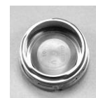
Properly installed Pirelli exhaust valve diaphragm (outer cover of exhaust valve not shown)