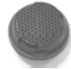
Pirelli Exhaust Valve

Read, understand and follow the instructions in the Instruction Manual for the Universal Pressure Test Kit when inflation testing Tychem® Level A garments. You can obtain a copy of these instructions by calling DuPont Personal Protection Customer Service at 800-931-3456 or from our website http://www.personalprotection.dupont.com .