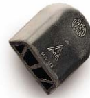
Auer Exhaust Valve

copy of the standard may be obtained for a fee from ASTM ( www.ASTM.org ) or by calling (610) 832-9585.