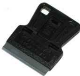
Razor Blade with handle (1)