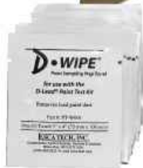
Individually wrapped D-Wipe® Towels (25)