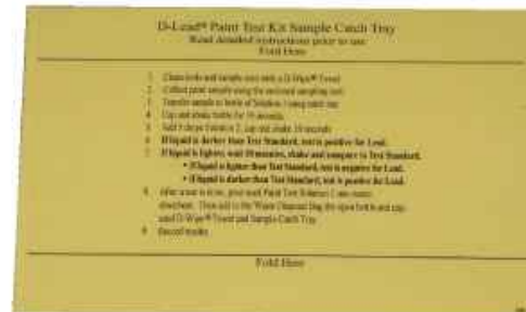
Sample Catch Trays (25)