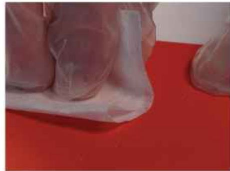
Clean sample area