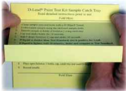
Fold Sample Catch Tray