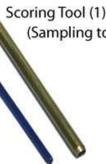
Scoring Tool (1) (Sampling tool)