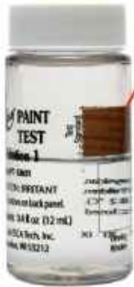
Solution 1 bottle (24)