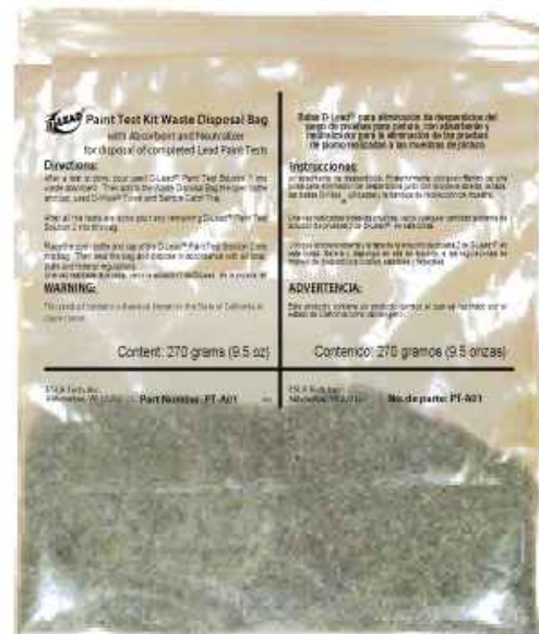
Waste Disposal Bag

Sample gloves, eye protection and hammer not included.