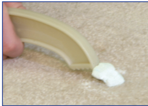
Scrape and Remove.