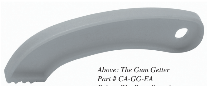
Above: The Gum Getter Part # CA-GG-EA Below: The Bone Spatula Part # CA-BS-EA