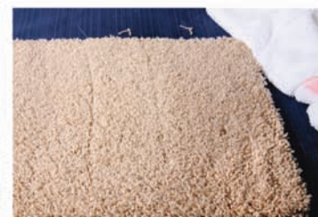
Lipstick gone. Happy Customer!