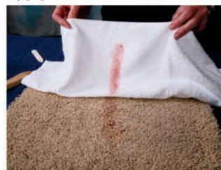
Take a look