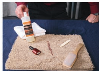
What you'll need

What you'll need: Matrix Breakdown, Spotting Towel, Bone Spatula, and Tamping Brush