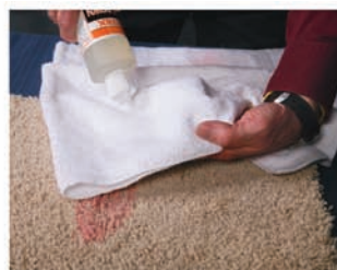
Apply Breakdown to clean towel