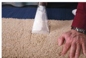
Rinse and extract