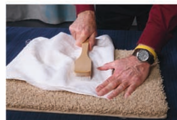
Tamp with tamping brush