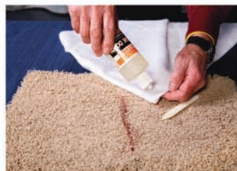
Apply Breakdown to clean towel