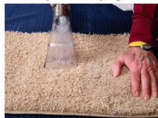
Rinse and extract