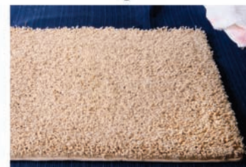
Polish gone. Happy Customer!