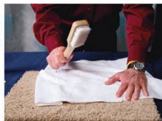
Tamp with tamping brush